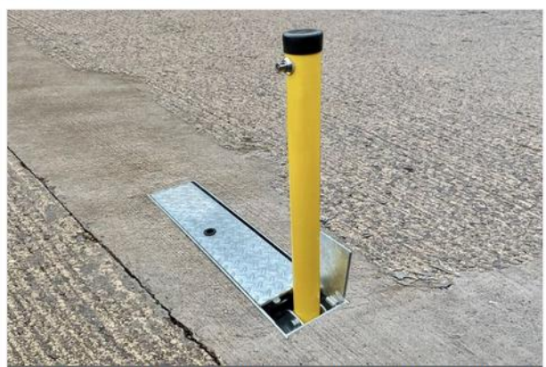
Foldaway Stealth Parking Post (Coffin Style Design): Robust Lockable Up or Down (Galvanised + Colours, SSteel)