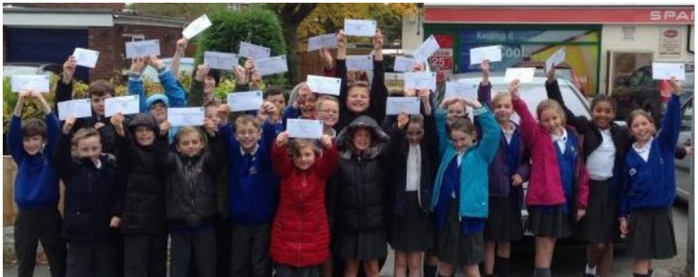
Wincham CP School children with their letters to Highways